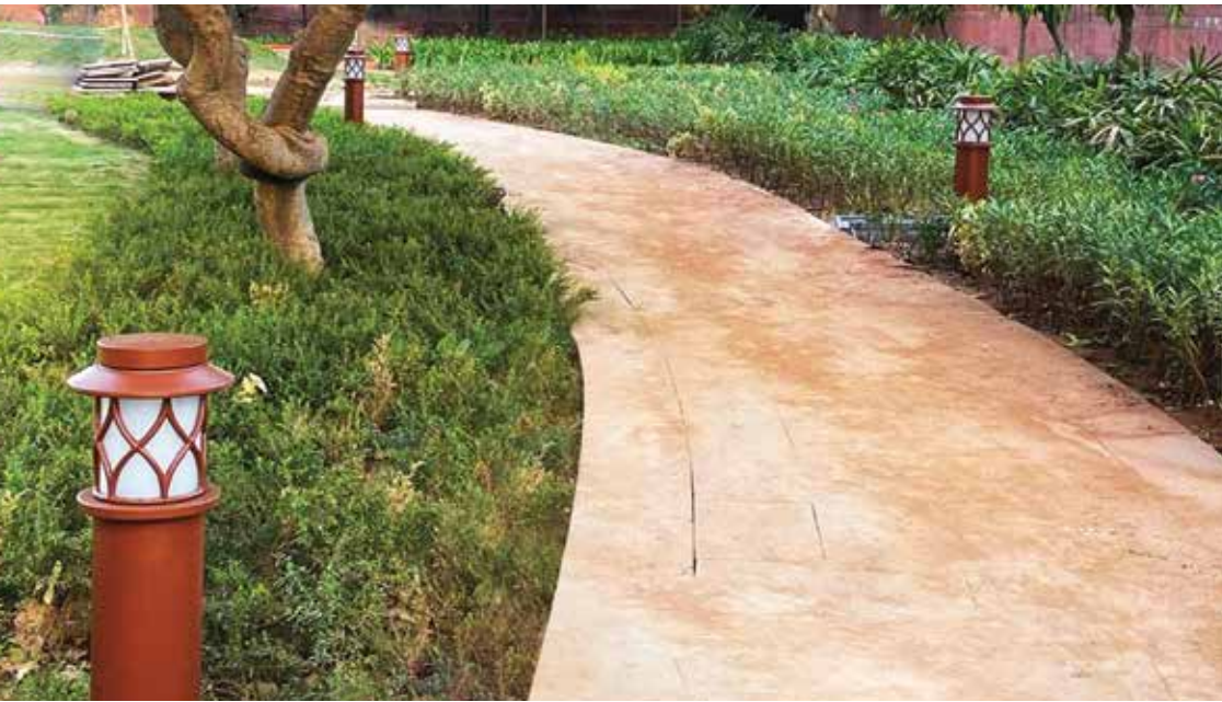
PARLIAMENT OF INDIA