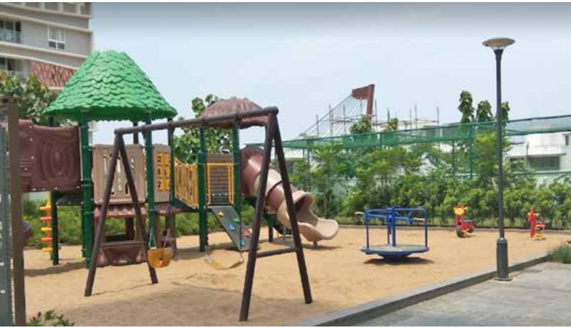
RAJAPUSHPA ATRIA, TELANGANA