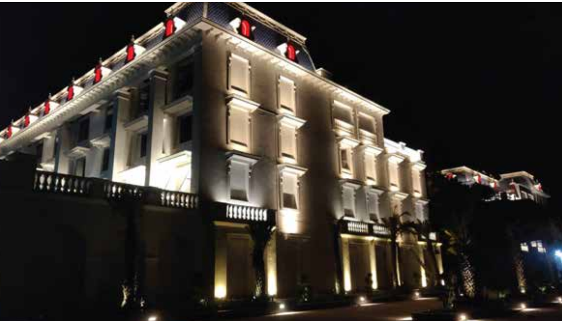
TAJ WELLNESS, GANDHI NAGAR