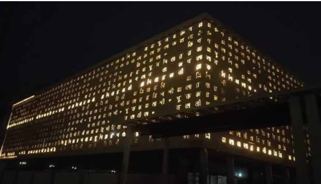
ITC CAMPUS, RAJARHAT, KOLKATA