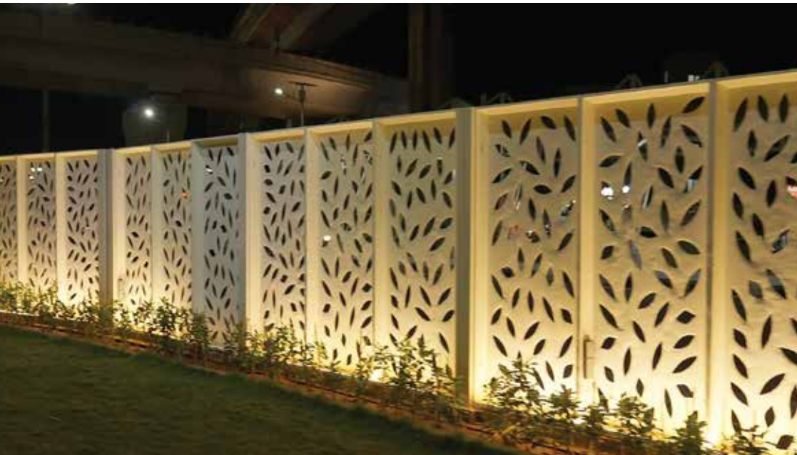
KATHIRARA URBAN SQUARE, CHENNAI