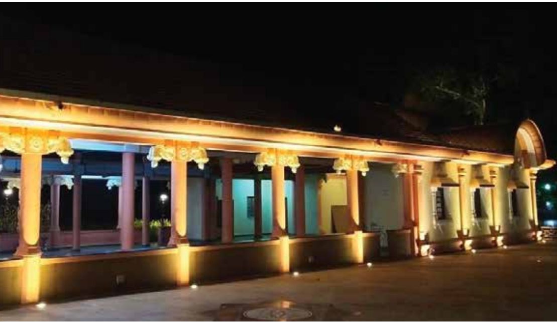
RADHA KRISHNA TEMPLE, GOA