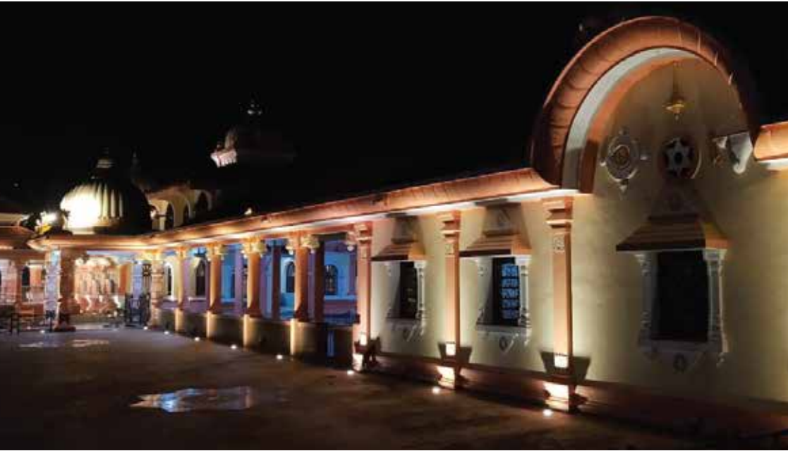
RADHA KRISHNA TEMPLE, GOA