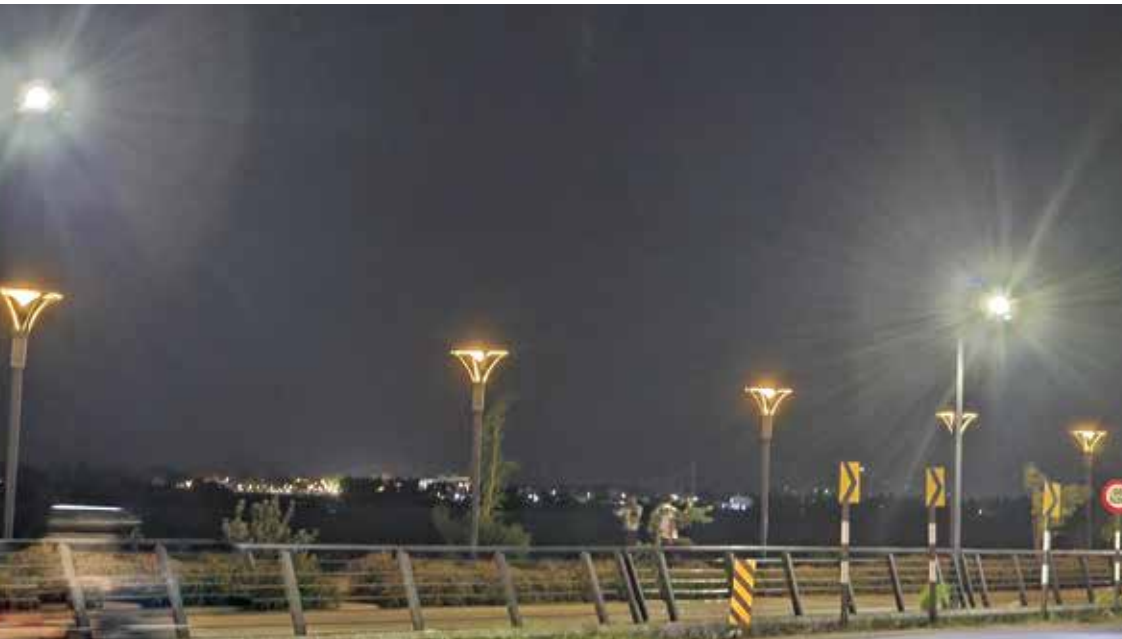
SMART CITY, COIMBATORE