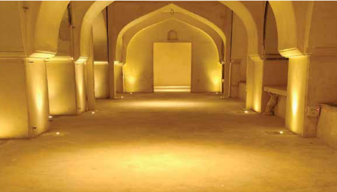
GAGAN MAHAL PALACE, HAMPI